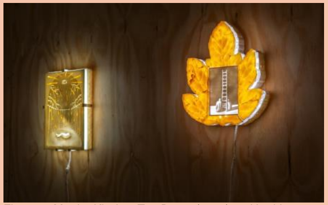
Figure 3: Martha Kicsiny: Too Brave (2024) and Ladder to Eden (2023), 3D printed lithophane, PLA filament, pine resin, LED lights, 24 x 18,5 x 4 cm & 24 x 26 x 6 cm.

My artistic research seeks to reposition lithophanes within contemporary art, highlighting their potential to connect to and rematerialize our current light-based digital culture, as it had a role in the genealogy of screens. By recontextualizing this overlooked medium, I aim to explore its material and conceptual possibilities in a modern context.