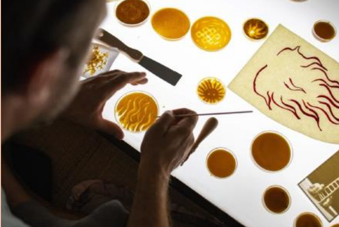
Figure 4: Photodocumentation of the Paramita Beeswax Lithophane Workshop, Hopp Ferenc East Asian Art Museum, Budapest, Hungary, June 2024.

Unlike traditional art forms, lithophanes rely on light, rather than pigments, to create imagery. This technique was developed in early 19th-century Europe, inspired by Chinese porcelain and jade screens. By varying the thickness of the porcelain slabs, artists created intricate images visible only when backlit, producing a detailed grisaille effect.