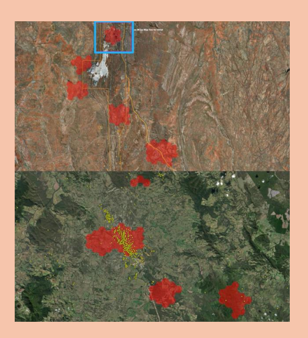
AI models specialized in detecting mineral ores.

contrast invites us to reimagine skill from post-human perspectives, nurturing relationships with other forces, species, and ways of sensing and engaging with the world around us.