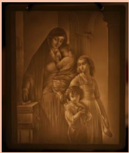
Figure 1: Lithophane (P.R. [sickle] 332) 13,2 x 11,1 x 0,3 cm, 19th century, porcelain. Backlit by candlelight. In the collection of the author.

Although lithophanes required exceptional artisanal skill, they were predominantly perceived as mass-produced decorative objects. Their unique material properties and reliance on light can contribute valuably to the history of light-based art and the possibilities of expanding drawing into the third dimension.